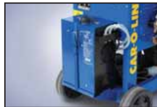
Also available in a water-cooled version with exclusive water cooling all the way to the tips!